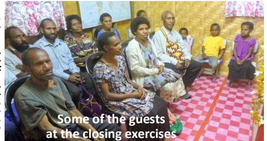
Some of the guests at the closing exercises