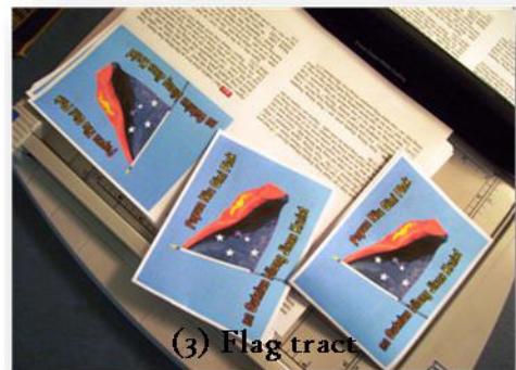
(3) Flag tract