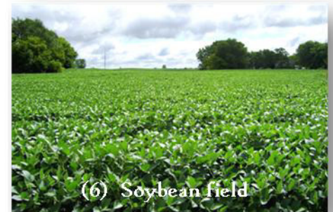
(6) Soybean field